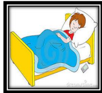
Malak has been sleeping .